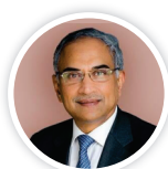
Dr. Venkat Ramakrishnan - UK